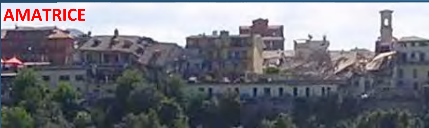
Photo taken on 2016.08.25 before an Mw 4.3 aftershock