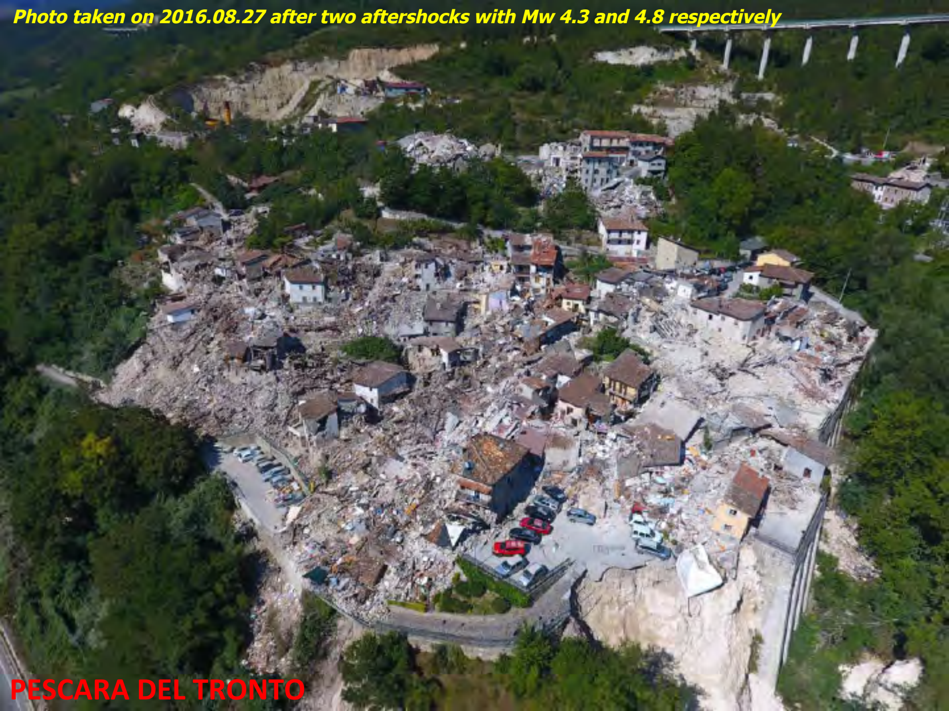
Photo taken on 2016.08.27 after two aftershocks with Mw 4.3 and 4.8 respectively