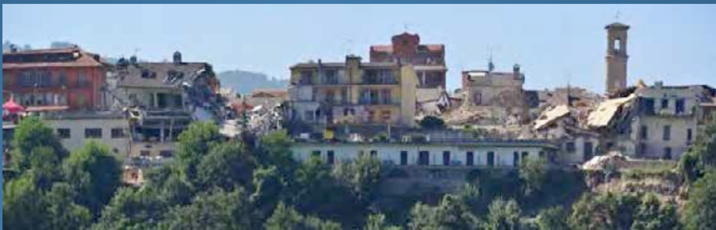
Photo taken on 2016.08.26 after an Mw 4.8 aftershock