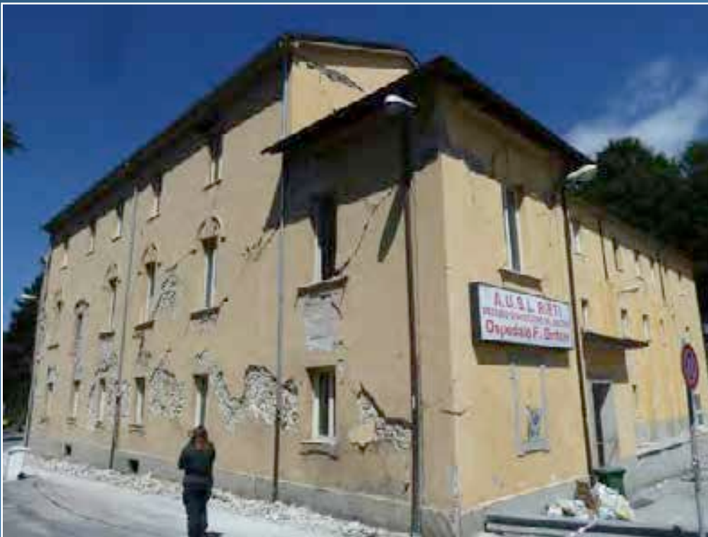
Photos taken on 25 August before a 4.3 aftershock