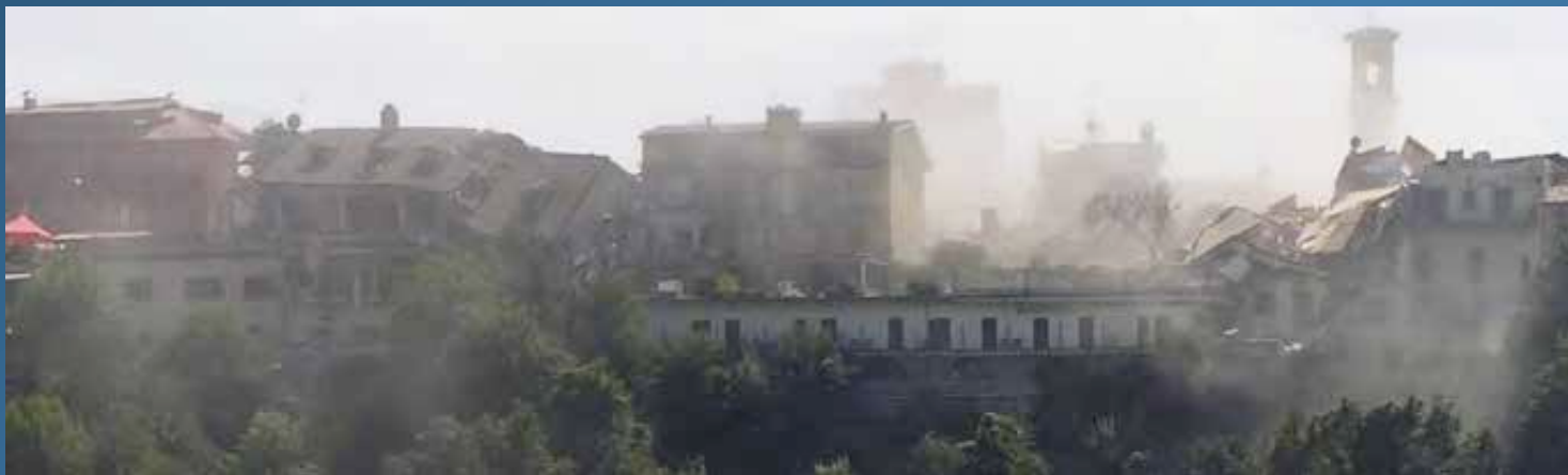
Photo taken on 2016.08.25 during an Mw 4.3 aftershock