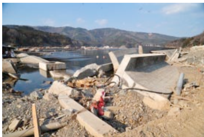
Fig.8. Destroyed port facilities and general alteration of the shoreline in Mizuhama town

Finally, the piers constructed in order to protect against tsunami waves, could not cope with the observed tsunami, either because of inadequate or underestimated structural design, or because of collapse, resulting in devastating effects on inland areas. In addition, severe failures because of intense erosion were observed in levees and coastal river regulation constructions (Fig. 8, 9).