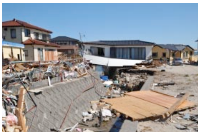
Fig.3. Of a wood frame residential construction and collapse of others, in Iwaki area