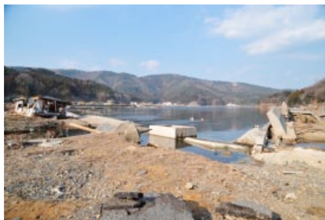
Fig.9. Destroyed port facilities and general alteration of the shoreline in Mizuhama town