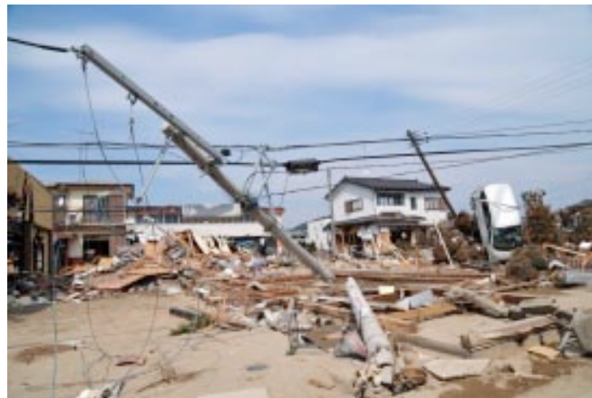
Fig. 11. Power distribution network damage in Isinomaki town