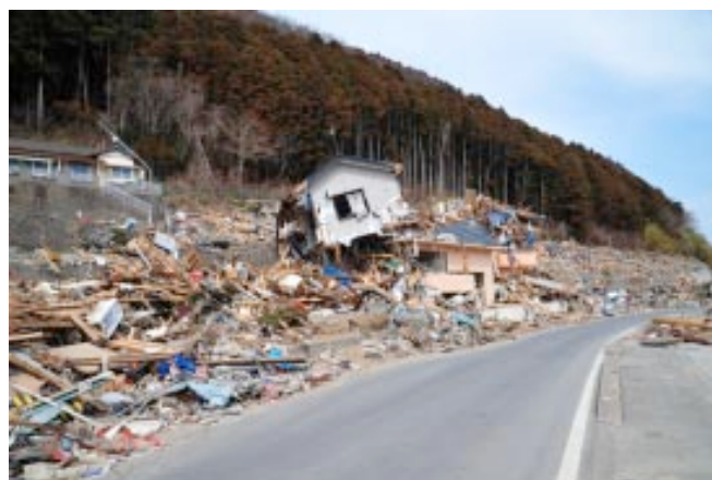
Fig.4. Transport and collapse of wood frame constructions inn Onagawa city

Some of these wooden houses were destroyed by fires broken out during the earthquake, or as a result of specific conditions that prevailed when the tsunami arrived.