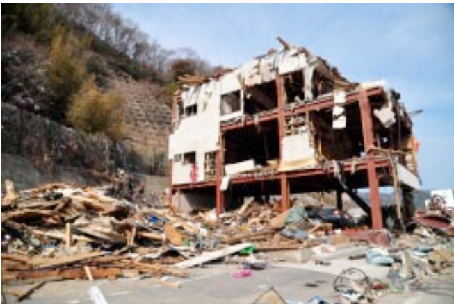
Fig.6. Masonry failures in steel frame building in Onagawa city

Many of these buildings, mainly those built near the shoreline, suffered great lateral loading on structural elements, resulting in a more or less general deformation of the structure. In some cases all of the steel elements were lifted from their reinforced concrete bases and were carried (totally deformed) in different areas. It should be noted that the masonry of the metal frame buildings proved to be much more vulnerable than that of the engineered reinforced concrete buildings (Fig.6, 7).