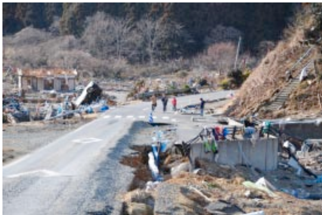
Fig. 10. Intense erosion and destruction of road network in Ommaehema town