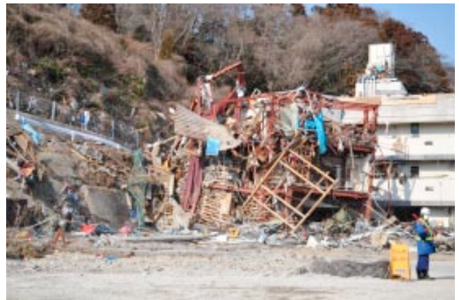
Fig.7. Total deformation of steel frame building elements in Onagawa city