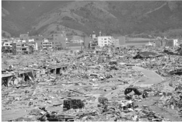
Fig. 5. Total collapse of constructions in Onagawa area. Near the coast, engineered reinforced concrete constructions can be seen damaged but standing