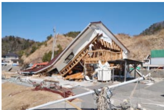
Fig.2. Collapse of a wood frame house in Iwaki area. Tsunami height of about 5 m

which were deposited in the inundated areas, or were carried to the cost-line or the open sea, when the water receded. A great number of this particular type of constructions were swept by their footings and were carried, practically unchanged, to great distances (Fig. 2, 3, 4).