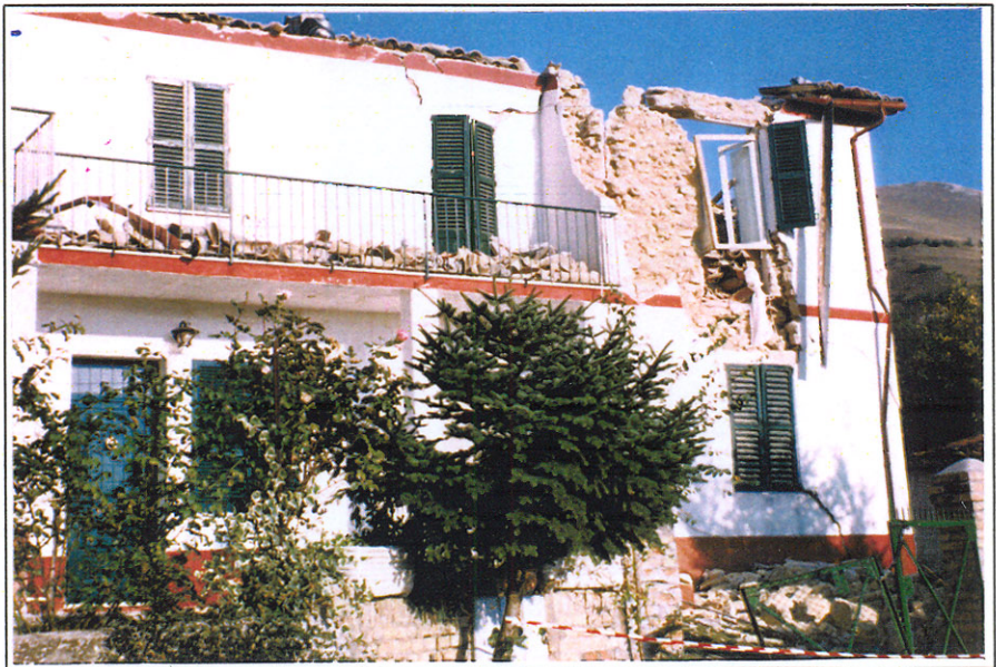
Figure 3: Collapse of the two-story building rubble masonry, in the settlement of Cesi