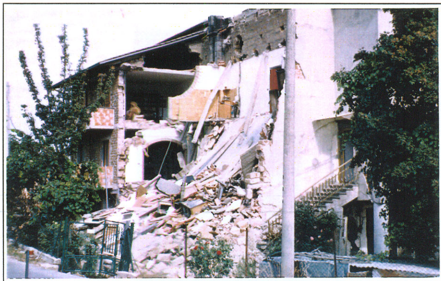
Figure 4: Partial collapse of two-story building in the settlement of Annifo.

Cathedral of S. Maria Assunta in Spoleto (1198) the interior nave arch has dislocated from the facade and there is a significant crack, plaster is falling from the dome and apparent water damage can be seen.