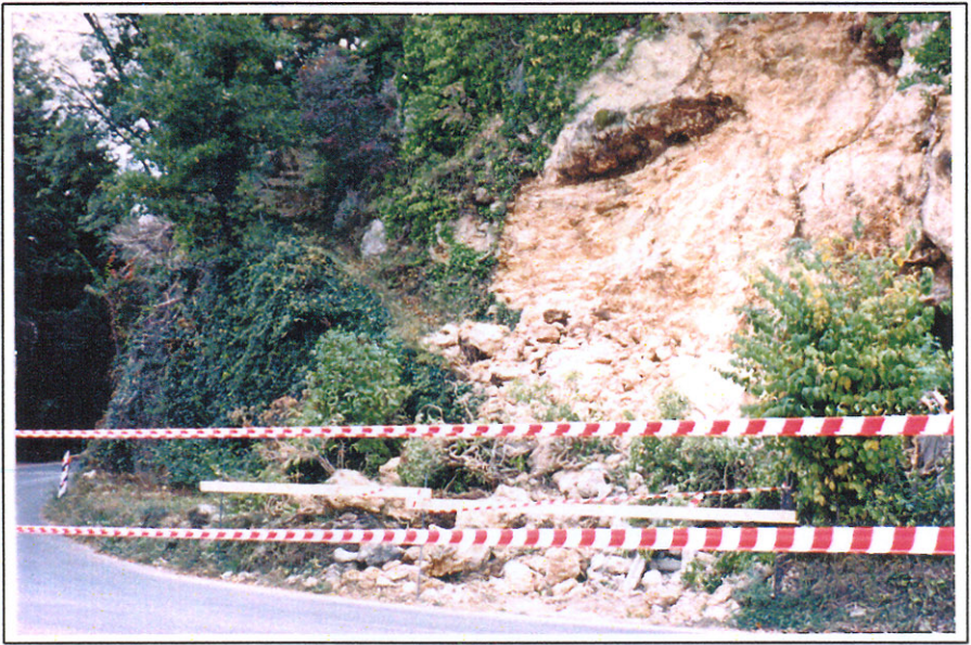
Figure 2: Small-scale landslide along the road Umbria Nocera – Annifo