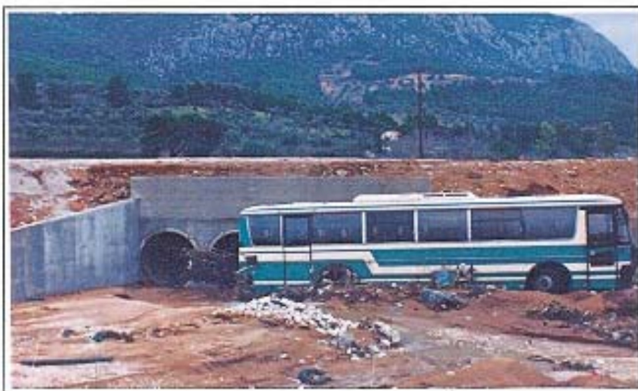
Figure 2: Motorway bridge pipes blocked by a bus that was carried away by the torrent.