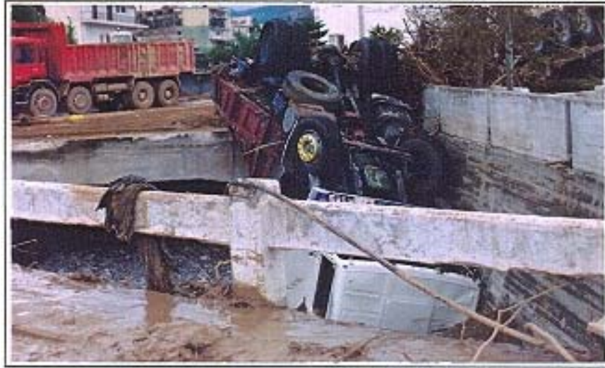
Figure 4: The parapets of the bridge were destroyed and trucks, that were swept off by the torrent, were wedged in between.

national motorway. The largest part of this volume had to be drained into the Corinth Gulf through the drainage network of Xerias, if we also take into account the factors that have reduced infiltration, as deforestation and occurrence of impermeable deposits.