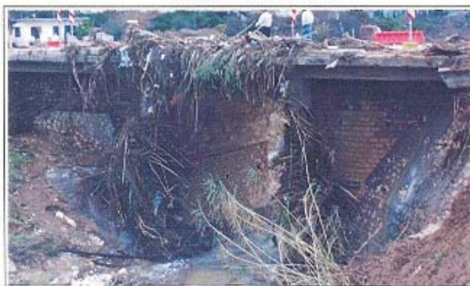
Figure 3: Large uprooted trees blocked the high arch bridge at Solomos village.